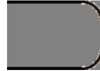
1/4 Round T&B